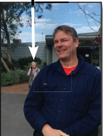
Spot Maggie Beer